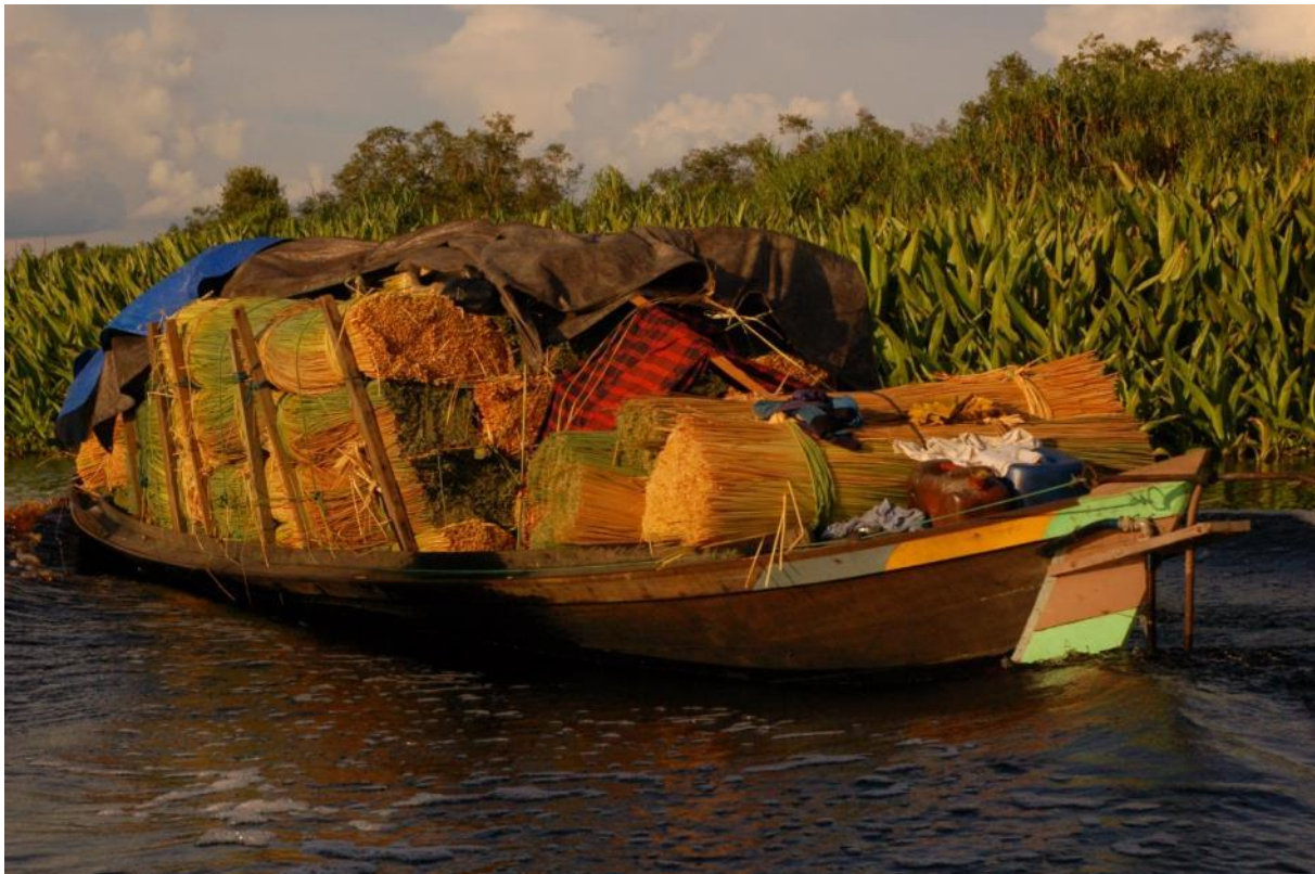
Purun harvest in Central Kalimantan, Indonesia.

However, restoring peatlands is not cheap. The World Bank estimates that financing Indonesia's peat restoration target to rehabilitate 2 million hectares would cost approximately Rp 27 trillion ($2 billion). In 2017 the Indonesian government allocated Rp 860 billion from the state budget to work on 400,000 ha. This is only 12.5 percent of what is required. So how to fill the gap? It is not all about money — even with unlimited funds, the government cannot succeed in isolation. A key part of the solution is intense coordination, effort and cooperation between all stakeholders; national and local governments, the private sector, civil society organizations and last but not least, peatland communities. Plenty of constructive meetings recently have identified why peatlands matter, how to help and what research is needed to solve the problem. That's great. But we have to remember the aim of argument and discussion is not victory, but progress. And we must start making progress now. There are three elements required for success.