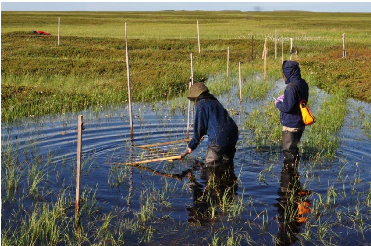
Local permafrost thawing and wetland expansion in the Indigirka lowlands (NE Siberia).