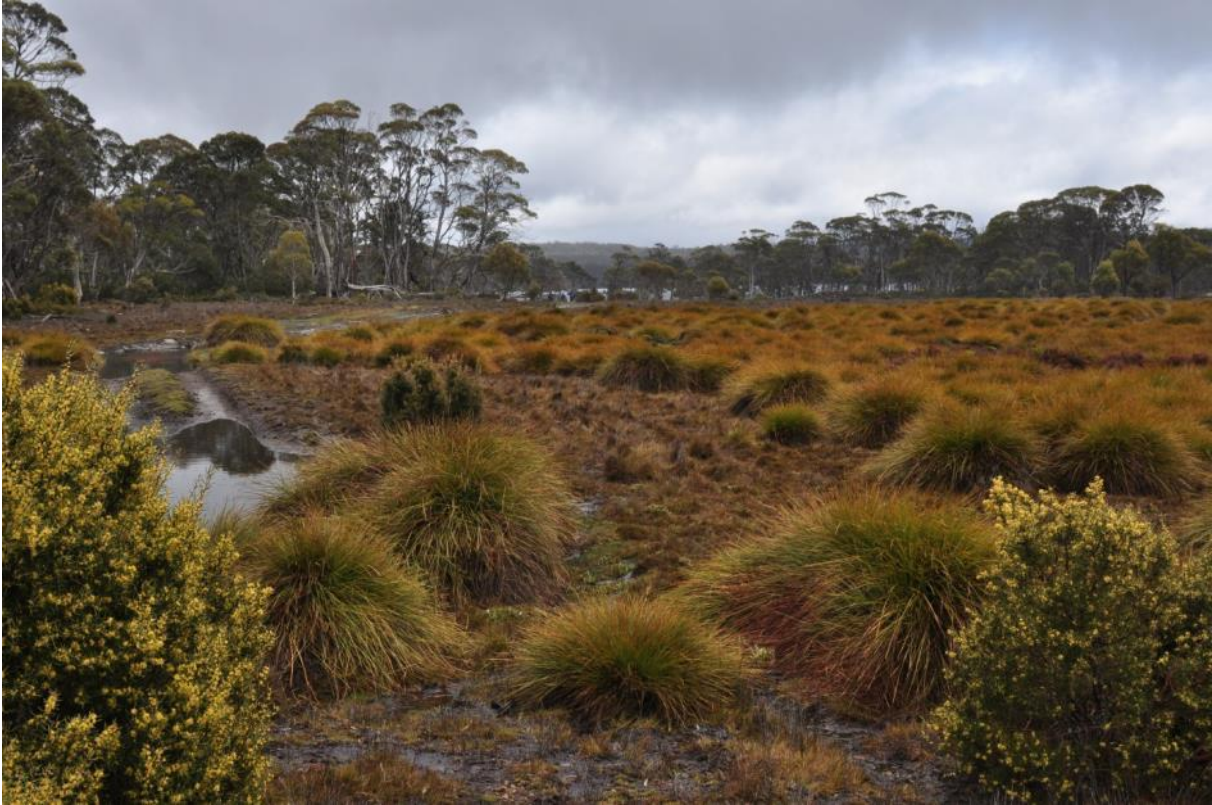
Buttongrass moorland in Tasmania.