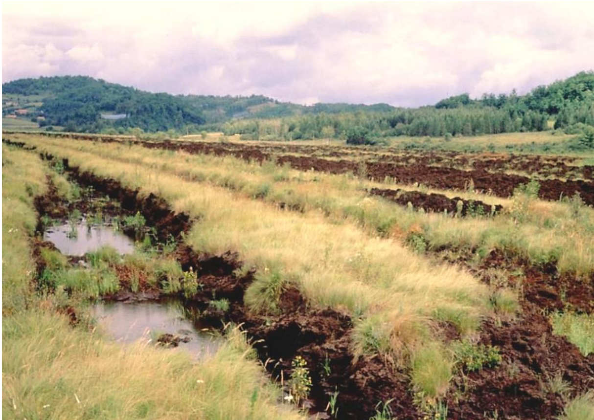
Sedge peat extraction site in Jilin, NE China.

peat industry of China, including a resource allocation strategy, a public awareness strategy, a technical strategy and a product strategy. The global resource allocation strategy is one of the Chinese peat industry's strategies. As more sphagnum peat and coconut coir are needed in order to use domestic sedge peat and agricultural residues, China has declared, at the 15th International Peatland Congress, that it will import 50 million m 3 of peat and coir from the international peat market. An increasing number of foreign companies has contacted the Chinese NC [IPS National Committee] concerning cooperation on peat resources, while more than 30 of them sent their representatives to China at the end of last year. The Chinese NC has also been appealing to the central government to decrease the customs tax for peat and coir, with some success, as the customs tax for coir has decreased significantly this year."