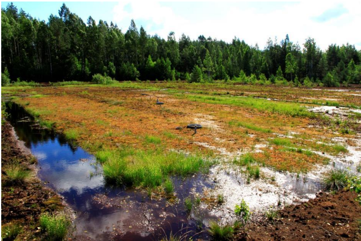
Restoration site on the edge of Tässä peatland in Central Estonia (abandoned in the middle of 1980-s) a few years after restoration.

Scientists of the Institute of Ecology and Earth Sciences, University of Tartu, won the project "Methods for restoration of water regime on extracted peatlands and monitoring". In co-operation with engineering companies they will work out restoration plans for at least eight extracted peatlands to evaluate different restoration methods and select the ones most suitable for local conditions. The effect of restoration on the