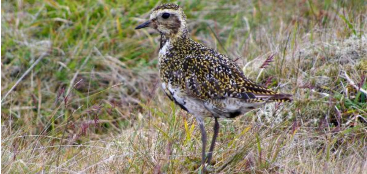
Golden plover ( Pluvialis apricaria ).

The conference 'Peatlands for Birds: Fens, Mires, & Bogs' (6-8 September 2017, Sheffield) will discuss how Britain's peatlands could or should be managed and restored to provide future resilient, sustainable habitats at landscape levels. It will examine ecology and conservation for restoring upland and lowland peatlands specifically, for birds. Further information & details: http://www.ukeconet.org/peatlandsforbirds.html