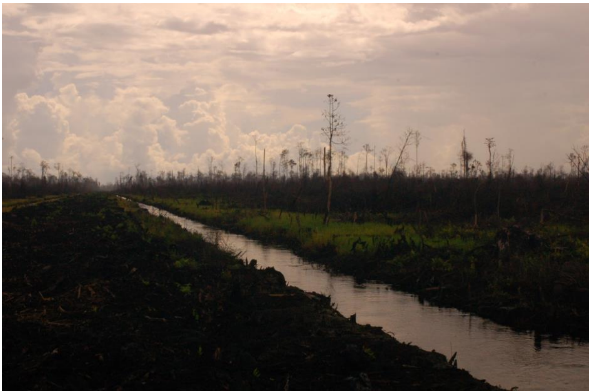
After the fire (Kalimantan).

To test whether Twitter could be used to monitor wildfire haze, the researchers analysed 29 million tweets posted in 2014 by more than 575,000 people from the Indonesian island of Sumatra – about 1 per cent of the island's population. Using geolocation data attached to tweets with hashtags mentioning the haze, the team was able to map hotspots as they appeared. During peatland fires, government sensors on the ground monitor the air quality in local areas. Lee says data from the tweets matched up with readings from the sensors. The tweets also revealed people's movements. When air quality gets especially bad, authorities issue evacuation notices via television, radio and SMS. Haze Gazer can reveal whether people are acting on that advice. "When we looked at mobility patterns together with air quality we could see people leaving bad air quality areas," says Lee. Using tweets to check if people are moving after an evacuation notice could be useful, says David Jones, CEO of Rescue Global , a non-profit NGO working in disaster risk reduction and response. But, he thinks it is important to be aware of the limitations of Twitter data. It would be risky to place too much trust in it. https://www.newscientist.com/article/2139177-wildfires-killer-haze-tracked-with-twitter-as-it-spreads/