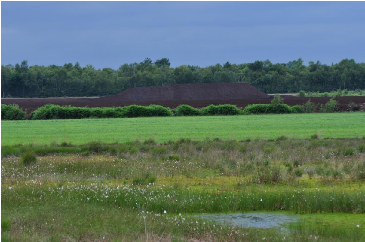
Diverse land use on peatland in Germany: forest, peat extraction, grassland, rewetting.

water regime, re-vegetation, GHG fluxes, different species groups and mire functioning will be evaluated. For this purpose, modern methods varying from satellite and UAW images and GHG flux measurements to classical geobotanical studies will be carried out engaging students from different specialities.