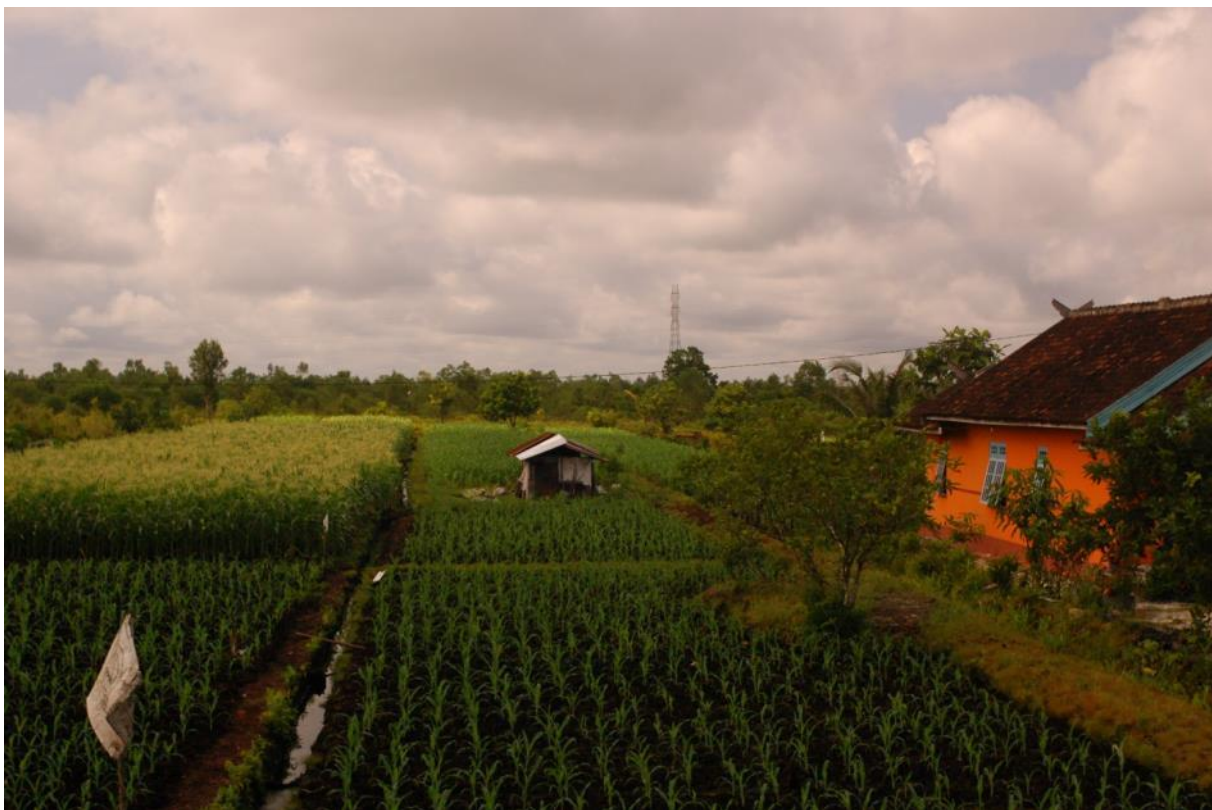
Peatland agriculture in Central Kalimantan (EMRP, Block C): Picturesque, but from a climate point of view as bad as catastrophic fires.

the results from field-emission studies of tropical peatlands. Miettinen and colleagues used this synthesis in conjunction with an updated land-cover map to revise peatland emissions in the western part of insular Southeast Asia. The researchers found that cumulative carbon emissions since 1990 were of the order of 2.5 gigatonnes, with 2015 emissions at around 146 megatonnes per year. Industrial plantations were responsible for 44% of the emissions, while small-holders were responsible for 34%, meaning that 78% in total were from managed land cover. "The estimates published in our paper are somewhat lower than earlier estimates, which resulted from conservative IPCC emission factors, but they are within a broad range estimated earlier," said Miettinen. Miettinen added that one reason peat fires receive more attention is that they are highly visible, generating lots of smog. But there have been positive developments in policy-making circles. "The countries in the region are increasingly considering measures to reduce their peat-derived carbon emissions," he said, "including the protection and rehabilitation of remaining peat swamp forests, and the implementation of best-practice water management in drained peatlands." From carbon sink to carbon source: extensive peat oxidation in insular Southeast Asia since 1990 Jukka Miettinen et al 2017 Environ. Res. Lett. 12 024014