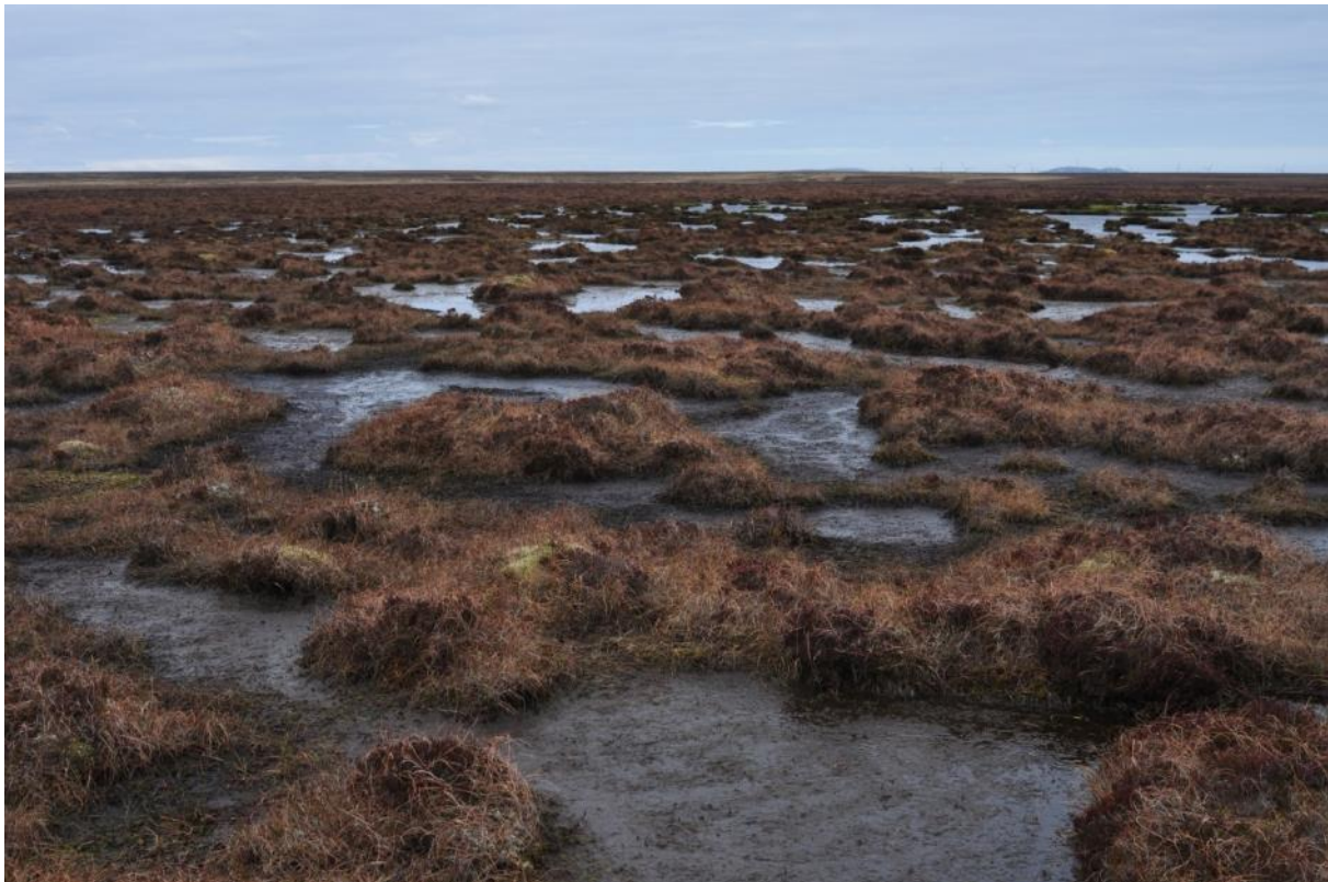
Munsary peatland in the Flow Country, Scotland.