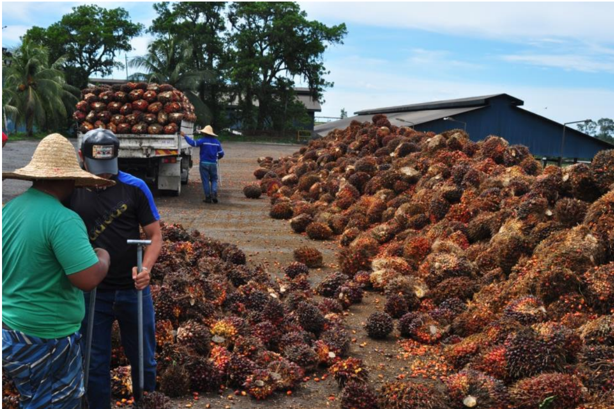
Oil palm fruit bunches supplied to the mill.