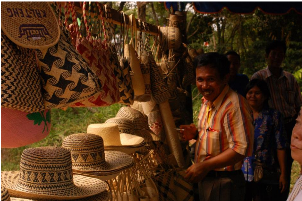
Handicrafts sales booth in Central Kalimantan.