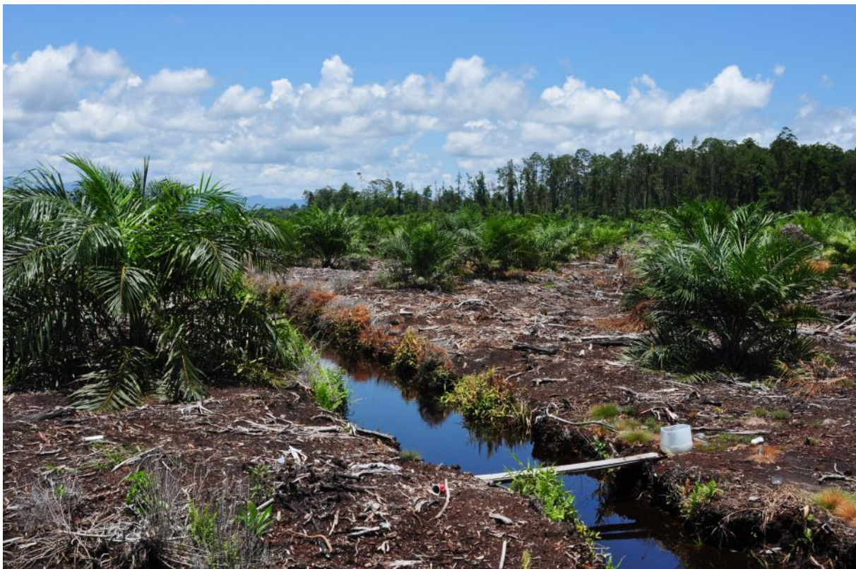
Remnants of the only conifer (Dacrydium beccarii) dominated peat dome in Borneo near Lawas, Sarawak, Malaysia, and part of the national Kayangeran Forest Reserve since 1925 (background), recently sacrificed to oil palm (foreground). Photo: Hans Joosten (24 August 2014).

http://www.valuwalk.com/2017/06/neste-oil-faces-revenue-risk-norwegian-market-public-procurement-ban-palm-oil-based-biofuels/?all=1